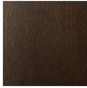
DARK SMOKED OAK