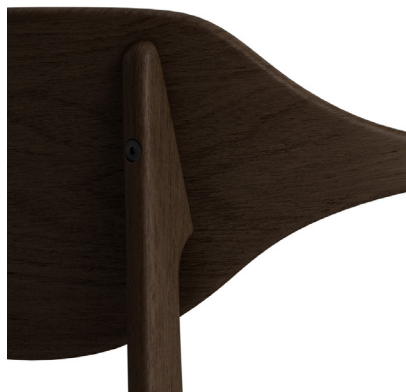
DARK SMOKED OAK BARNUM BOUCLE COL 3