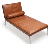
MAN CHAISE LOUNGE

Width: 82 cm Length: 150 cm Height: 78 cm Seat height: 34 cm