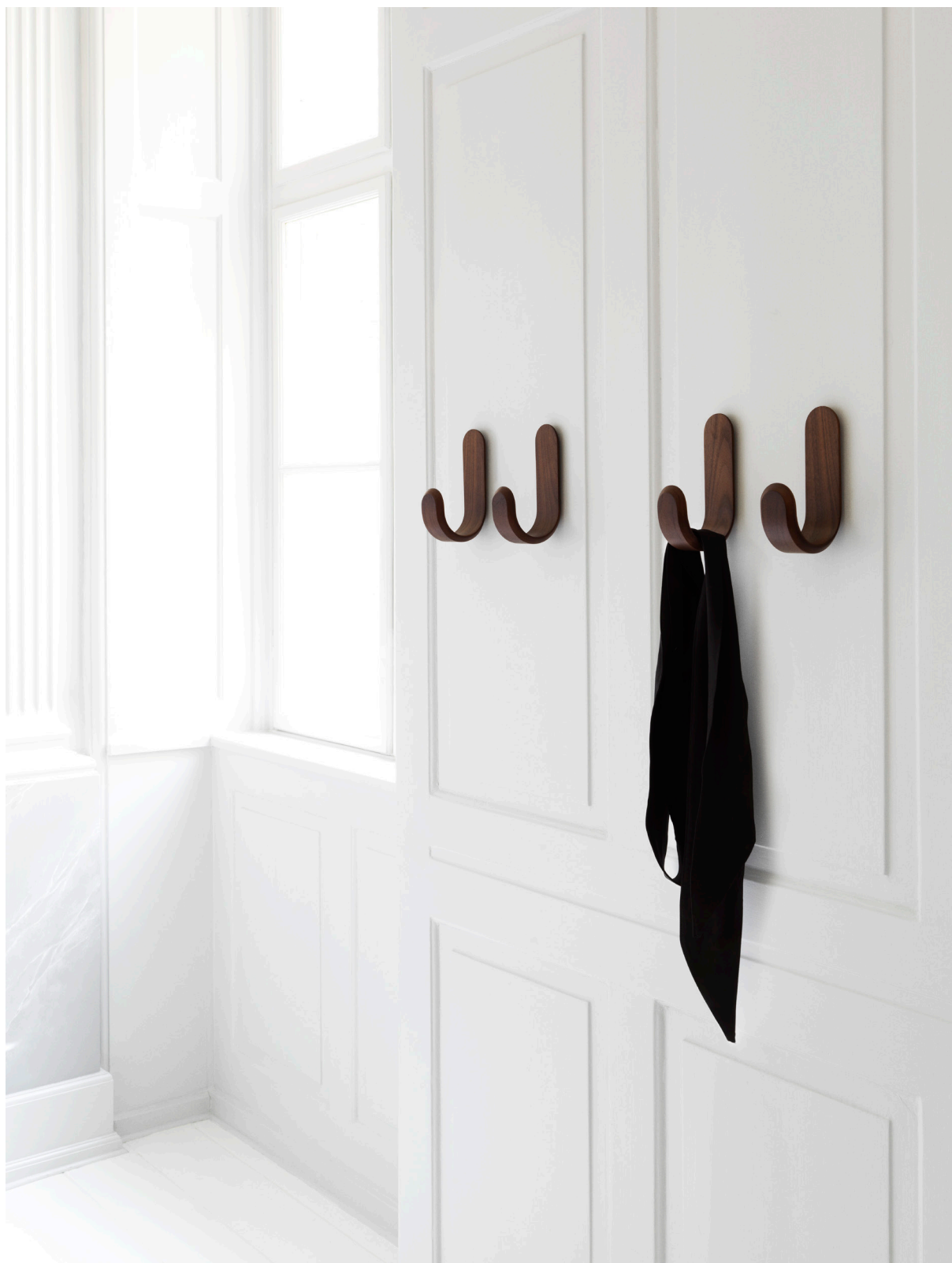
Curve hook in walnut