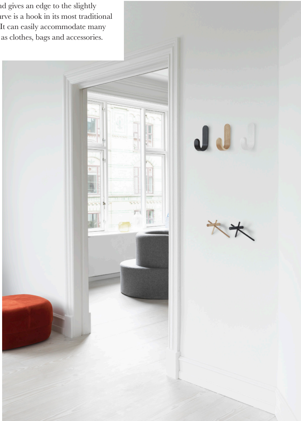
Curve hook in black, ash and white, shown with Sticks hooks and Circus pouf

The Danish designer Peter Johansen has created a wooden hook in a contemporary design, with references to the classic Danish design of the '50s. The Curve hook has the classic, uncomplicated, and intuitive shape of a hook. The faceted rounding breaks up the simple feel and gives an edge to the slightly oversized design. Curve is a hook in its most traditional and symbolic form. It can easily accommodate many kinds of items, such as clothes, bags and accessories.