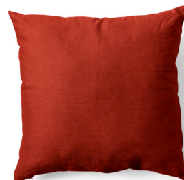
Burnt Sienna 5216389