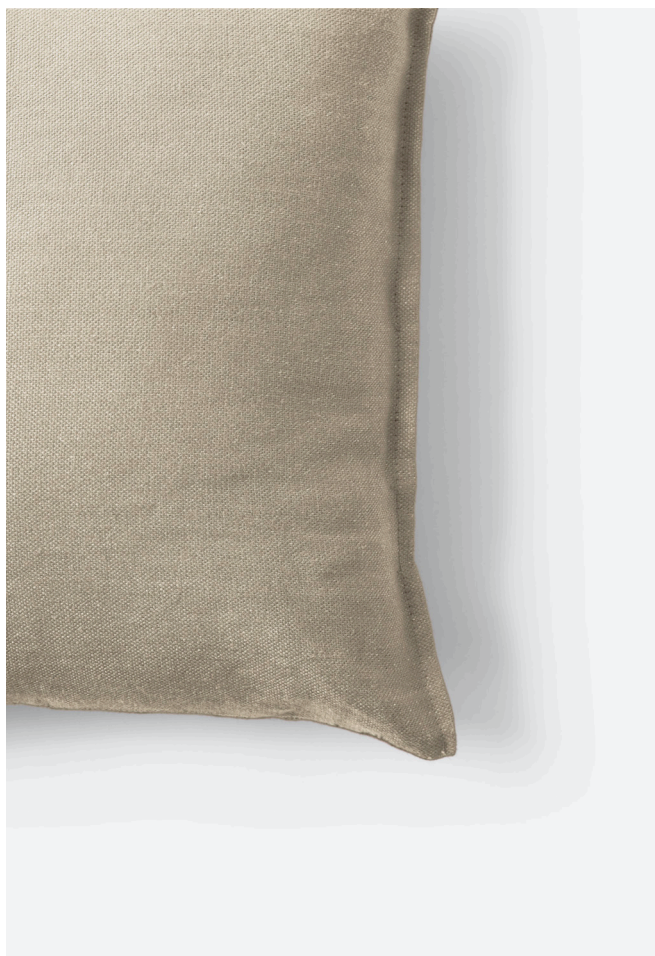
Mimoides Pillow, 40x40, Birch, by Norm Architects

The sumptuous Mimoides pillow is a great textile choice. Produced in Europe using mono-materials and free of harmful chemicals. The cover of the Mimoides Pillow is sewn using linen that grows softer with time. The linen is yarn-dyed for durable, rich colour profiles.