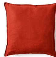
Burnt Sienna 5217389