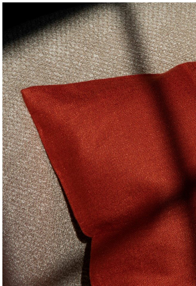
Mimoides Pillow, 60x60, Burnt Sienna, by Norm Architects

The sumptuous Mimoides pillow is a great textile choice. Produced in Europe using mono-materials and free of harmful chemicals. The cover of the Mimoides Pillow is sewn using linen that grows softer with time. The linen is yarn-dyed for durable, rich colour profiles.