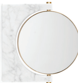
White 3 610639